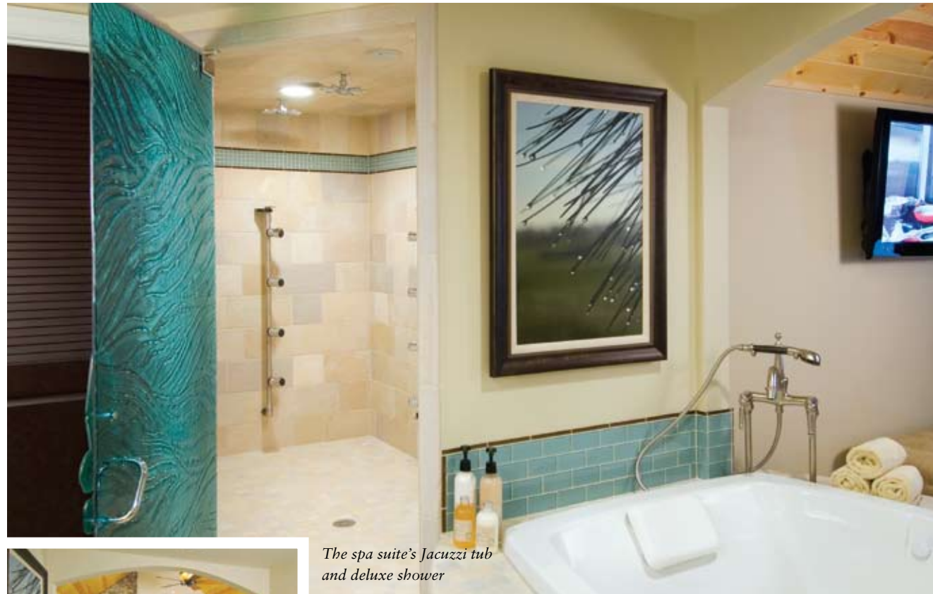
The spa suite's Jacuzzi tub and deluxe shower