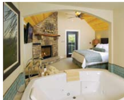
The Equani Spa's bedroom suite

There are also unique ritual treatments that seek to create a harmony between body and spirit by drawing from the Native American culture. One such two-hour treatment is the Way of the Circle Ritual, which combines the relaxation of a massage with an invigorating mud masque. You enter the room and commence by stepping out into an enclosed patio replete with a chaise and tub that overlooks the lush green setting. The therapist quietly burns sage as you fan the smoke over your body and breathe deeply to inhale its rich aroma. This is inspired by the Cherokee smudging ceremony, where elders believed a person must cleanse themselves of bad feelings before healing can begin. Then the massage starts as the therapist rubs oil and mud in circular patterns starting with your right foot and proceeds up your right side to your left, as if completing a circle around your body. Now covered in this rich masque, you are wrapped in a cocoon of warm towels and rest in comfort while oil is applied to your hair for a scalp and face massage.