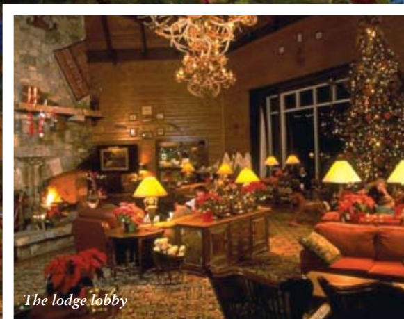
The lodge lobby